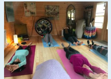
Mindful connection and Relaxation