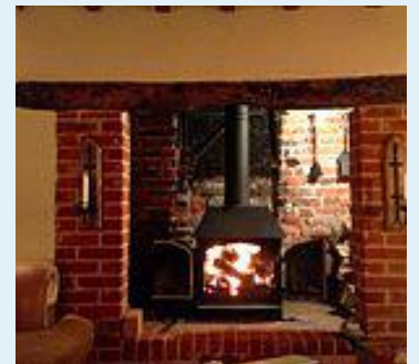
Reignite your fire within

Find out more about our outstanding retreat venue in the beautiful Norfolk Broads: